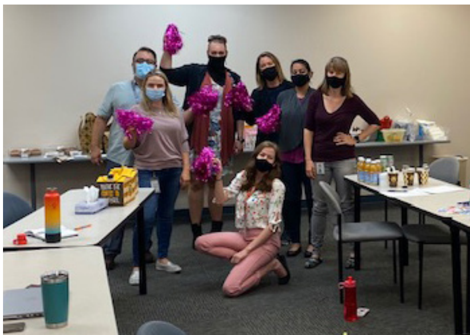
Las Vegas Metropolitan Police Laboratory, winners of the 2021 NFSW Trivia Competition.

CACNews: Thank you so much for taking the time to chat with us. We are looking forward to what you come up with next year!