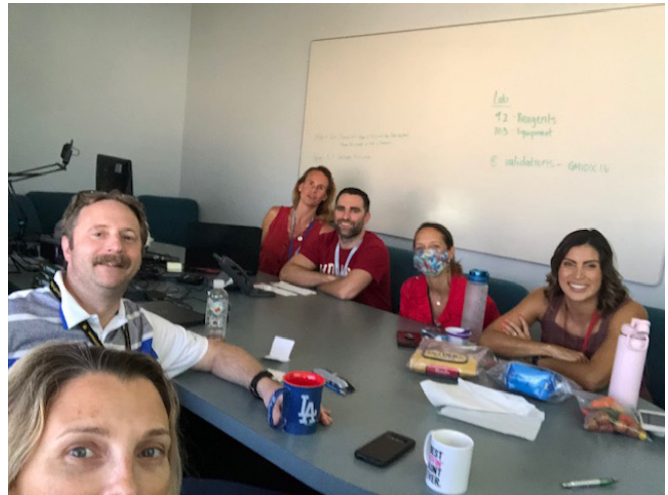
Orange County Crime Laboratory