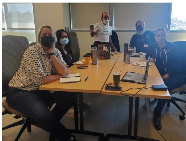
Los Angeles Police Department