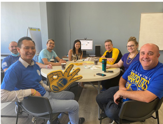
Oakland Police Department