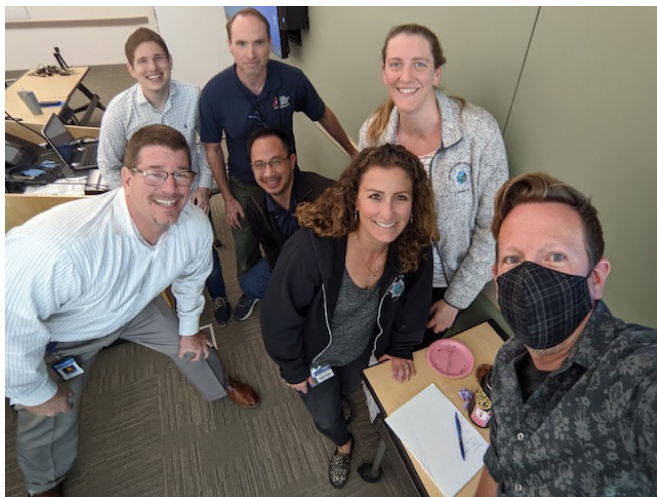
San Diego County Sheriff's Department