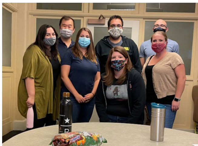
Los Angeles County Medical Examiner-Coroner