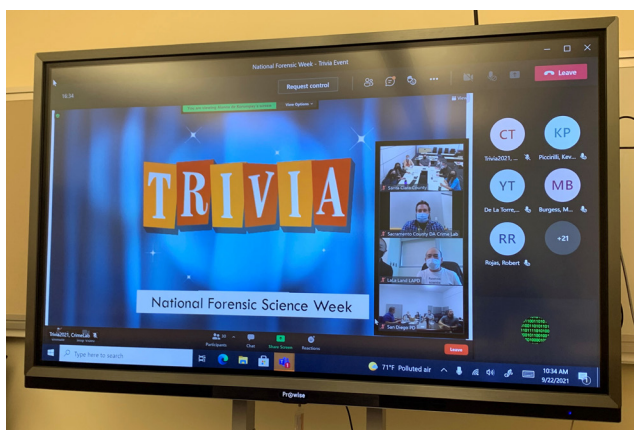
Trivia screen as viewed from the Santa Clara County District Attorney's Crime Laboratory.