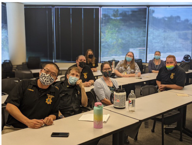
Contra Costa County Office of the Sheriff

Thank you to all laboratories who participated in this year's competition!