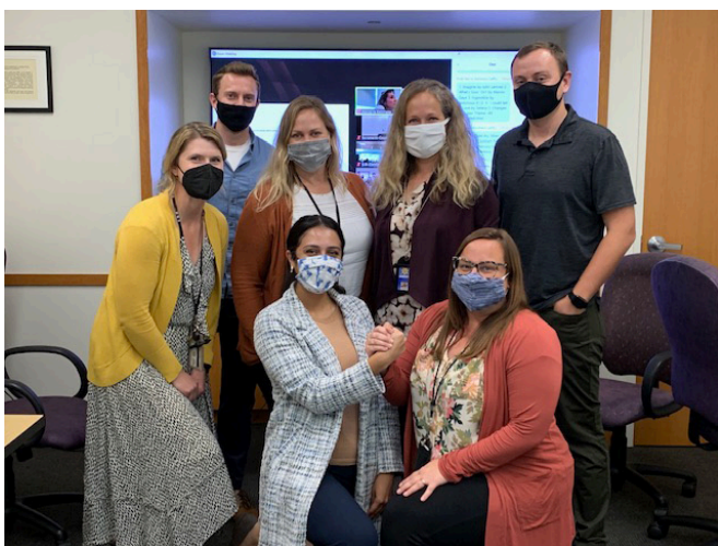
San Mateo County Sheriff's Office