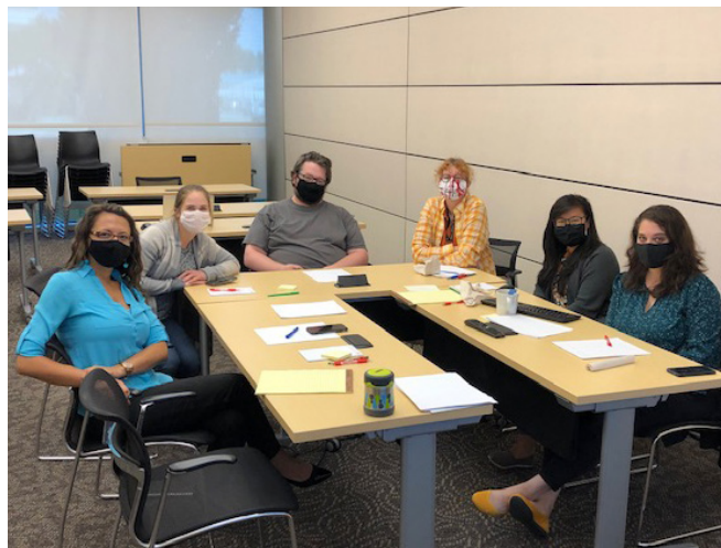
Santa Clara County District Attorney's Crime Laboratory