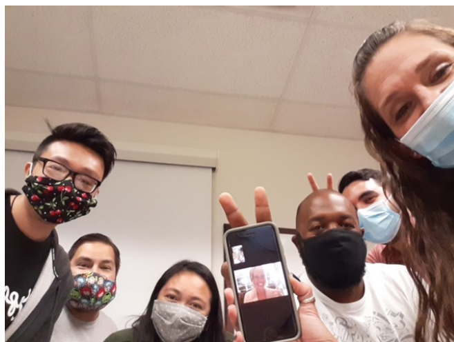
Santa Barbara DOJ Crime Laboratory