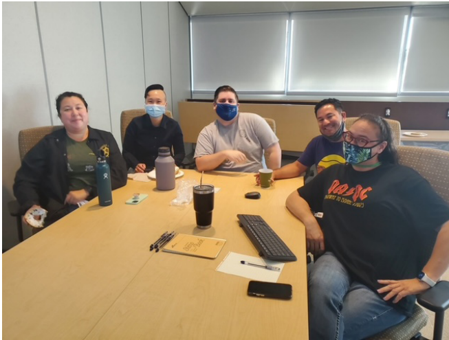
Los Angeles County Sheriff's Department