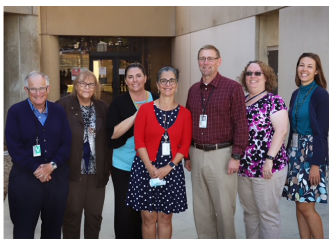
Ventura County Sheriff's Office