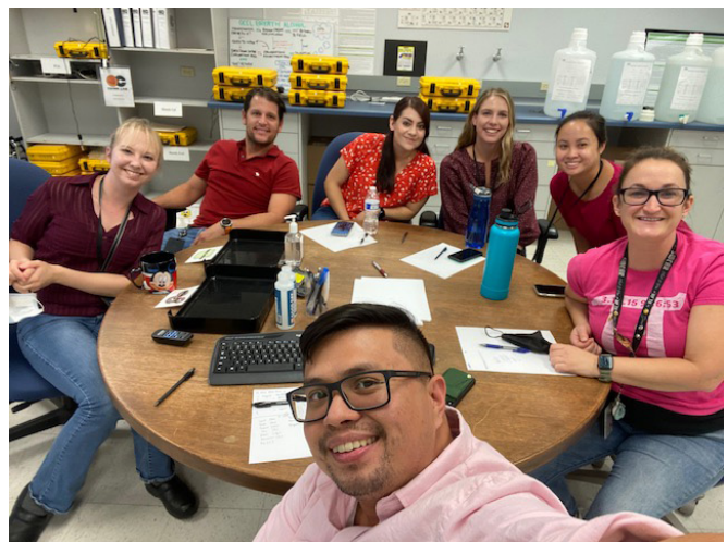
Orange County Crime Laboratory