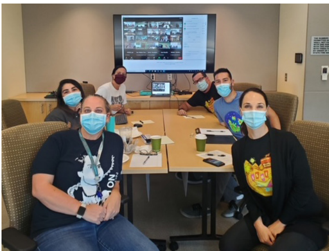
Los Angeles County Sheriff's Department