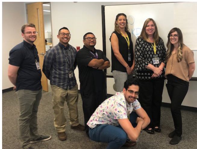
Kern Regional Crime Laboratory